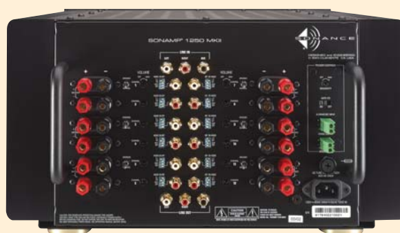
Twelve channels enable you to configure the perfect system for a home theater or whole-home application.

1250MKII and 1230 12-Channel Amps. The 1250MKII and 1230 have L/R, AUX and direct channel inputs with DIP switches that give you the ultimate flexibility in system configuration. Both models have 12 channels that can be bridged in pairs. For example, a single 1250MKII could have two pairs of channels bridged to provide 100 watts/ch of power to a set of speakers for a dedicated listening area, while the other eight unbridged channels provide 50 watts/ch of power to a four-room distributed audio system. Tamper-resistant input sensitivity controls simplify adjustments, while binding post speaker terminals accept five different types of speaker wire terminations. And like all Sonamp amplifiers (except the